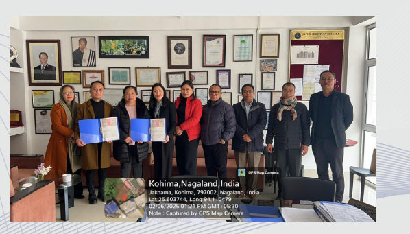
JAPFU CHRISTIAN COLLEGE, KIGWEMA