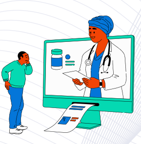
MEDICAL HEALTHCARE SERVICE