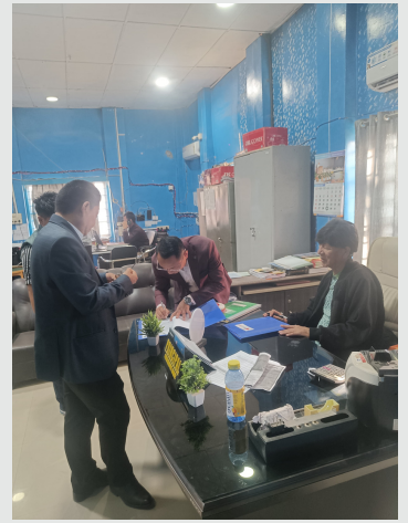
CHURACHANDPUR GOVT. COLLEGE, MANIPUR

This collaboration marks a crucial step in empowering students with the right skills, fostering industry-academic partnerships, and driving employment opportunities in today's dynamic job market.