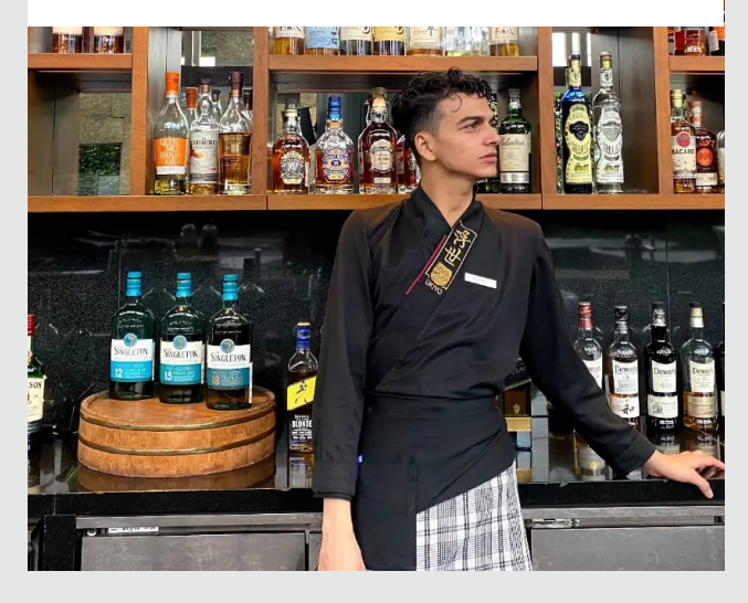
ALILA DIWA, GOA